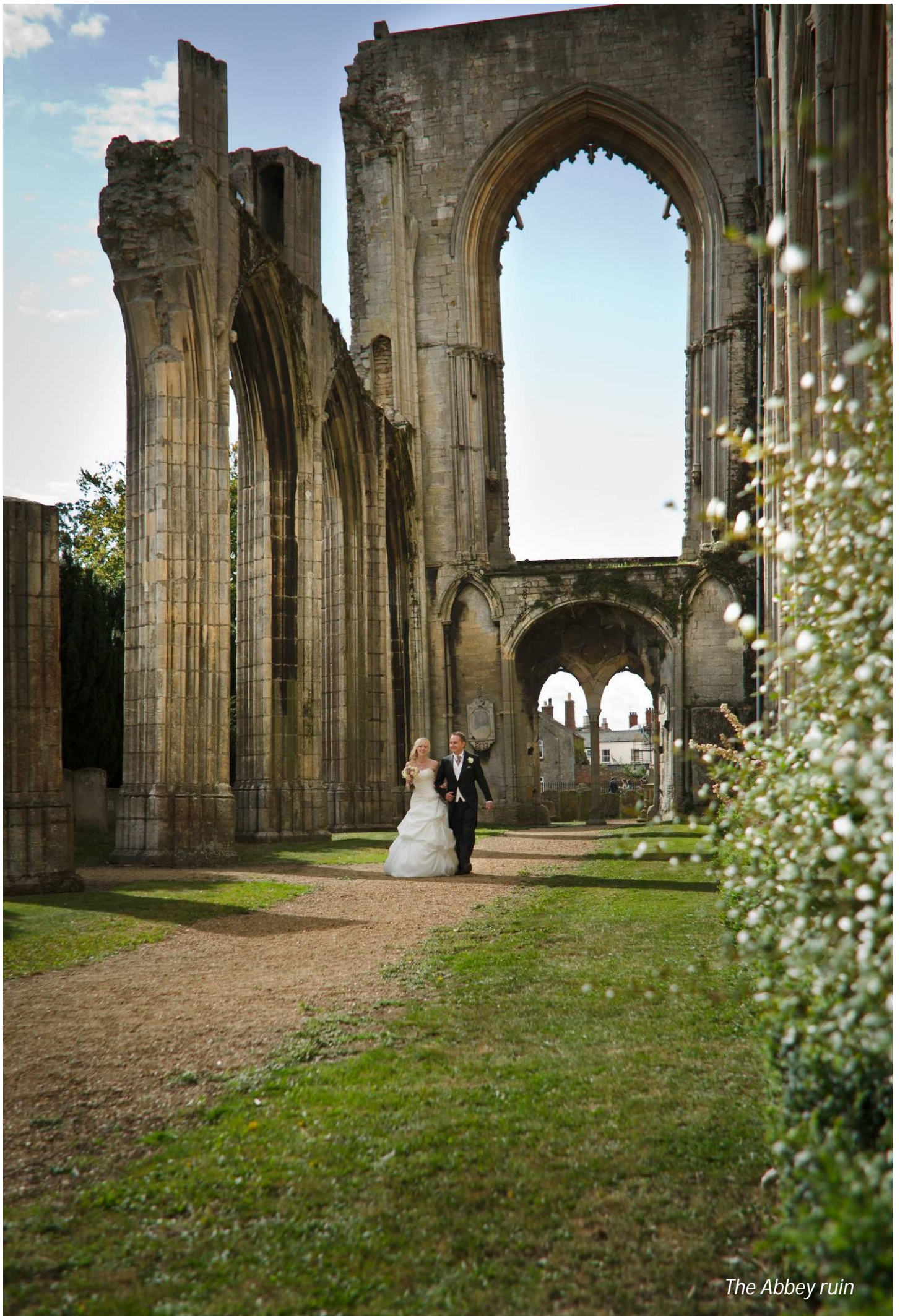
The Abbey ruin